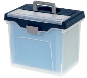
Large Mobile File Box Item: 656096