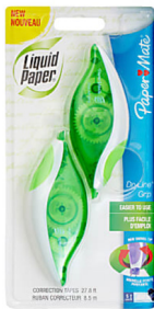
Paper Mate® Correction Tape, 2/pk Item: 254089