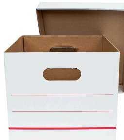
Standard-Duty Storage Boxes, 10/pk Item: 6275549