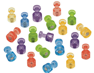
Quartet® Magnetic Pushpins, 20/pk Item: 117400