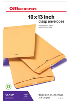
Manila Clasp Envelopes, 100/pk Item: 330888