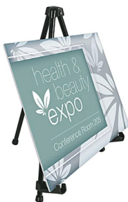
Tabletop Display Easel Item: 615595

Need to Register for ODP Business Solutions Discounts?