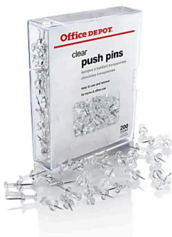
Round Pushpins, 200/pk Item: 825265