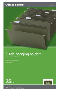
Hanging Folders, 25/pk Item: 811018