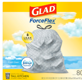
Glad® Tall Kitchen Trash Bags, 80/pk Item: 745444